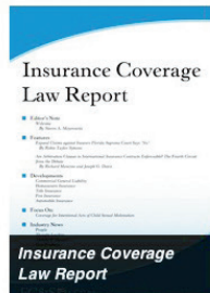
Insurance Coverage Law Report