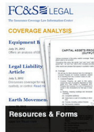
Resources & Forms