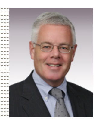
Counsel Capital Finance & Real Estate