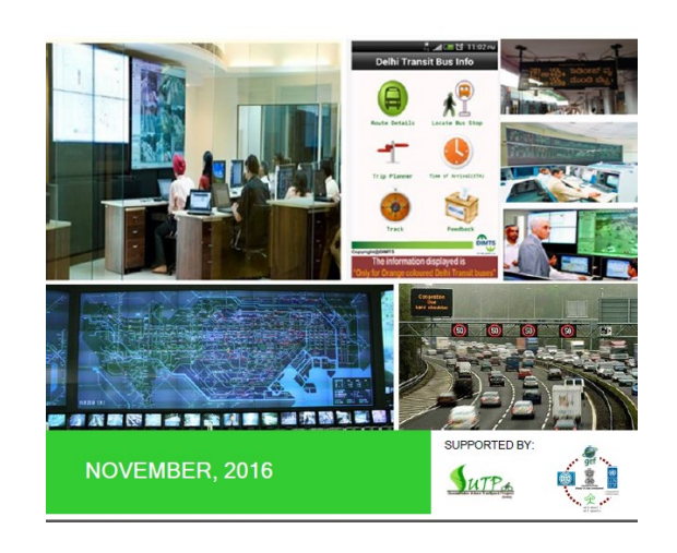
TRAFFIC MANAGEMENT AND INFORMATION CONTROL CENTRE (TMICC) OPERATIONS DOCUMENT