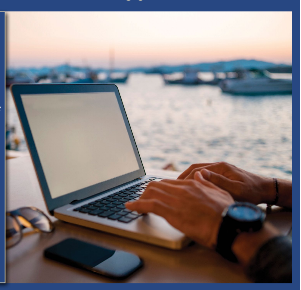
Be-Anywhere Benefits are just the beginning.

Collaborate online with thousands of members using the MBA's proprietary social networking tool.